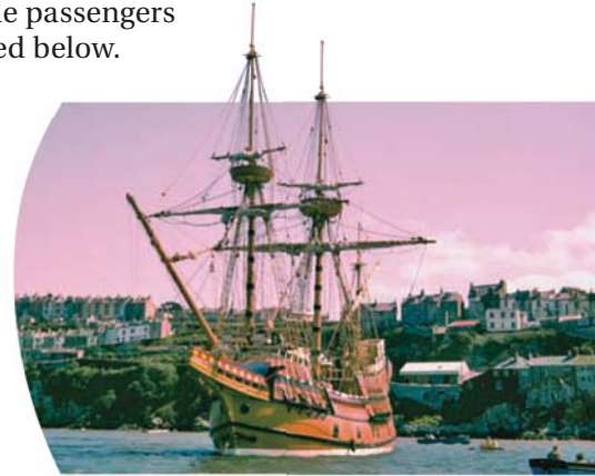
Replica of the Mayflower